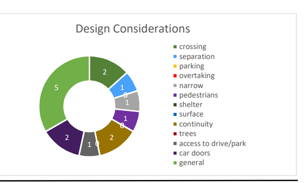
Design - Option A